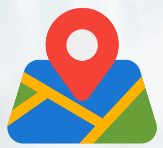
The Brock Niagara Fallsview