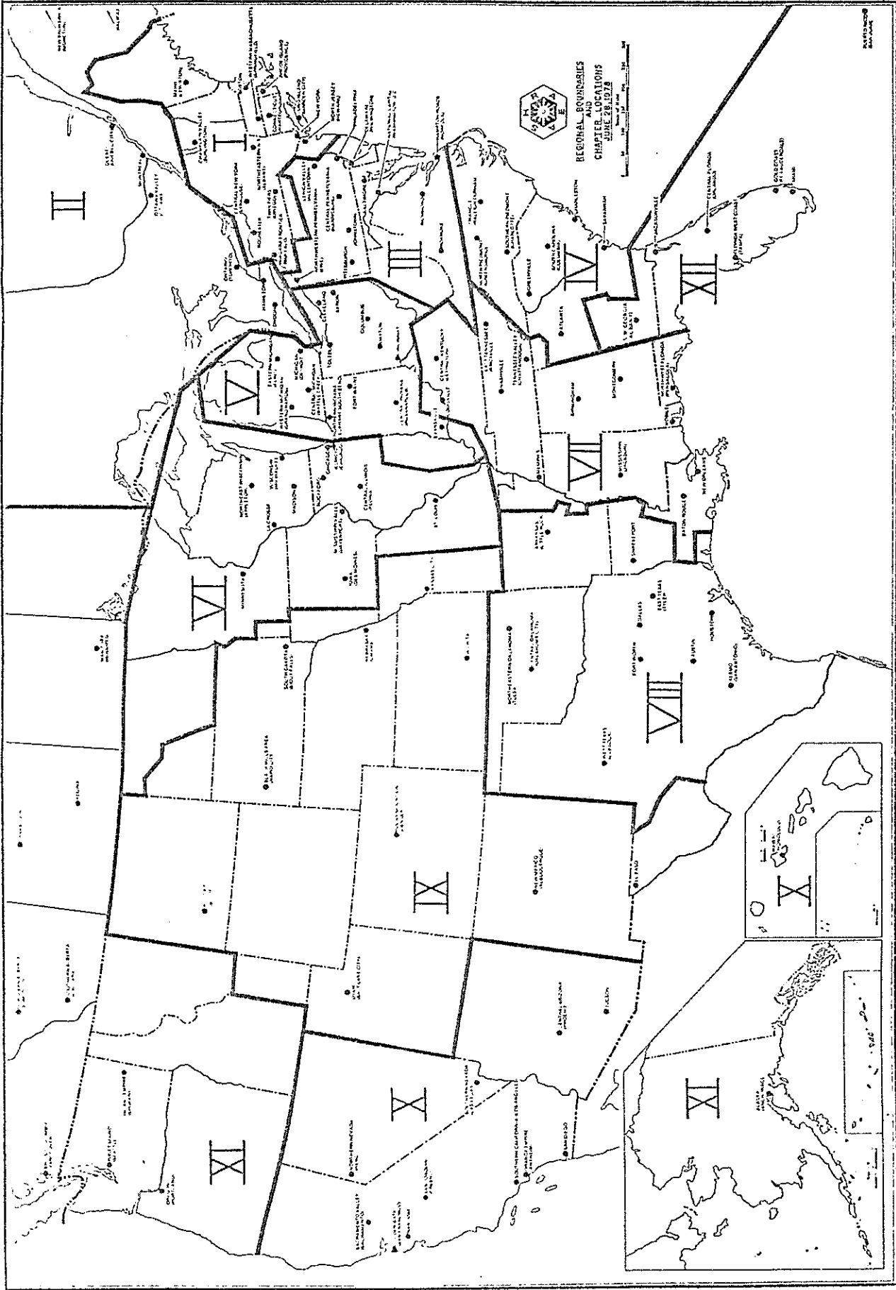
September 15, 1978 ASHRAE in Canada - a new look! 8 chapters in the East, forming Region II and 6 Canadian chapters in the West plus 4 American chapters in the East, forming Region XI